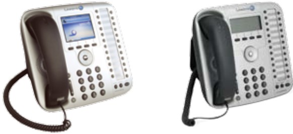
Linksys One IP Phones: PHM1200, PHB1100

Linksys One IP phones offer all the functionality of a key system or PBX with premium voice quality, personalized phone options and advanced services and applications. The phones have built-in local Voicemail and Auto Attendant/After-Hours service.