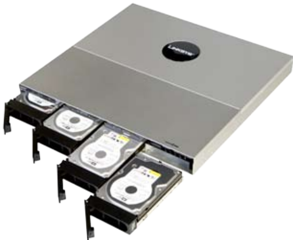
Linksys One Ready Network Storage Systems: NSS4000, NSS4100, NSS6000, NSS6100

Linksys Business Series Network Storage Systems (NSS) are Network Attached Storage (NAS) products to share, store and back up business-critical data.