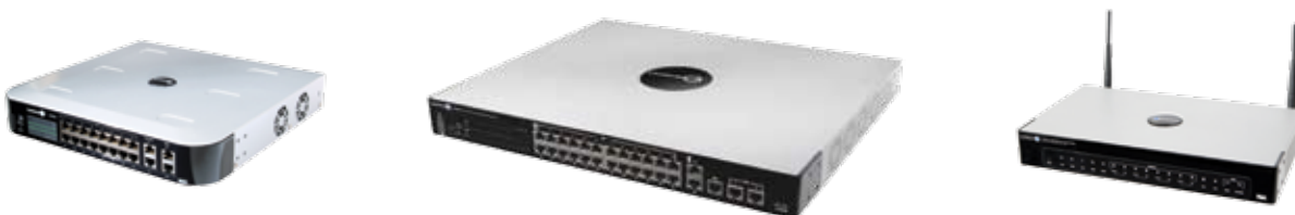
Linksys One Services Routers: SVR3000, SVR3500 and SVR200

The Services Router (SVR) is a converged communications and services platform (voice, video and data) for the Linksys One system. This all-in-one box is the backbone of the Linksys One system providing: 1) a secure network infrastructure with optional wireless connectivity, 2) a telephone system with local storage of voicemail, 3) secure Internet access, 4) real time network management, and 5) business applications on demand. SVRs also provide auto-discovery and auto-configuration of Linksys One devices. The SVR also offers expansion to other Linksys One Ready (or traditional Ethernet) Switches and Network Storage Systems.