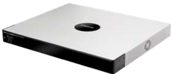
Linksys Redundant Power System: RPS1000

Increases system availability by providing uninterrupted operation against power supply failures in Linksys One Ready storage devices and switches.