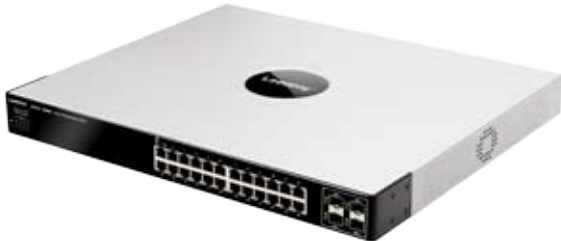
Linksys One Ready Stackable Switches with optional Power over Ethernet (PoE): SFE2000, SFE2000P, SGE2000, SGE2000P

Companion Fast Ethernet and Gigabit Ethernet stackable switches for the Services Router allow expansion to 100 users.