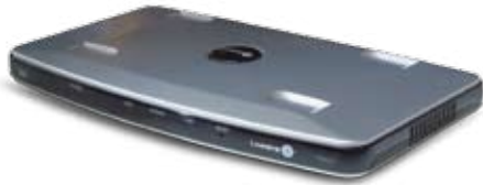
Linksys One Voice Gateway: VGA200, VGA2100, VGA2200

Linksys One analog voice gateways provide connectivity to the public switched telephone network (PSTN) for making and receiving external calls, and connect analog fax machines and legacy phones they wish to continue to utilize on the Linksys One network.